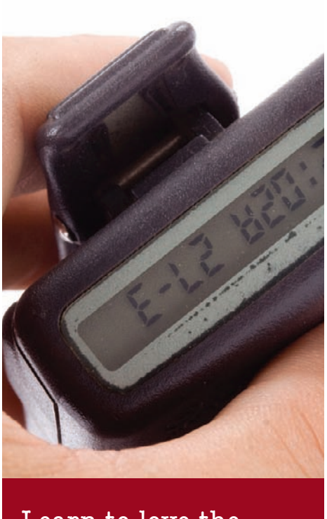
Learn to love the pager

Most importantly, have an agreement that whatever was interrupted by the pager will be finished later. The pager should not become an excuse for not finishing important conversations, completing household chores, or spending family time together. As a spouse or significant other of a firefighter, an important communication skill to learn is to be able to stop a conversation when a call comes in and resume that conversation when both of you are in a comfortable place and able to continue.